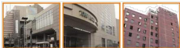
Kawagoe Prince Hotel Kawagoe Tobu Hotel Kawagoe Dai-ichi Hotel

Multiple hotels providing a range of facilities and services, including Wi-Fi, are available in central Kawagoe City near to train stations and sightseeing spots.