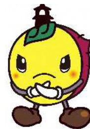
Mascot of Kawagoe City, Tokimo

There are growing cases where heavily drunk individuals lie down on a street and are involved in a serious car accident. To prevent accidents, please use high beams when you drive in low lit areas at night . The high beam will make it easier to find people or objects in the street.