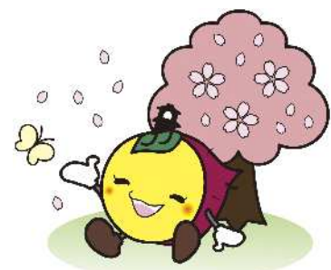
Mascot of Kawagoe City, Tokimo