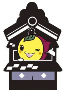
Mascot of Kawagoe City: Tokimo

The new Showagura is for visitors from inside and outside Japan as well as the local people to enjoy and experience Japanese Sake. Please come and visit the newly renovated Showagura.