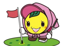
Mascot of Kawagoe City: Tokimo