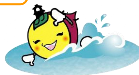
Mascot of Kawagoe City: Tokimo