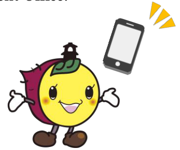
Mascot of Kawagoe City: Tokimo

*Flood forecast is distributed when banks of rivers in other municipalities have given way and there is a possibility of flooding striking Kawagoe City.