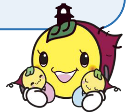
Mascot of Kawagoe City: Tokimo

かわごえし しょ こそだ 川越市には、30か所の「子育て しえんしせつ 支援施設」があります。そこで こ おや あつ は、子どもと親が集まって、 じゆう あそ こうりゅう 自由に遊んだり、交流したり かね できます。お金はかかりませ じぶん いえ ちか しせつ ん。自分の家の近くの施設に、 きがる い 気軽に行ってみてください。